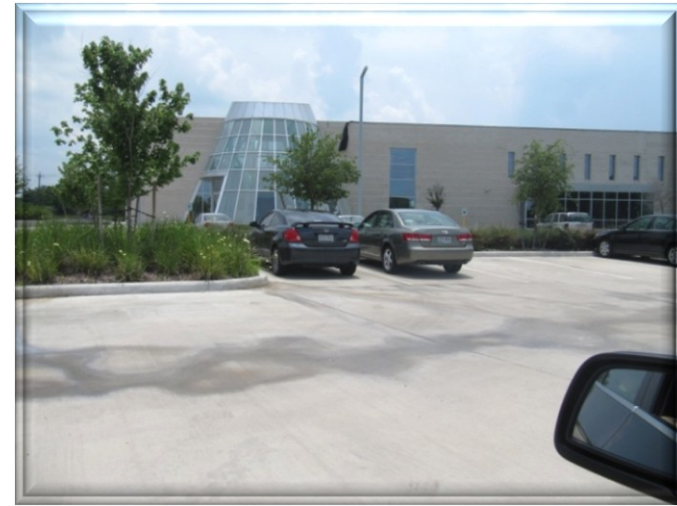
India House at West Belfort Blvd