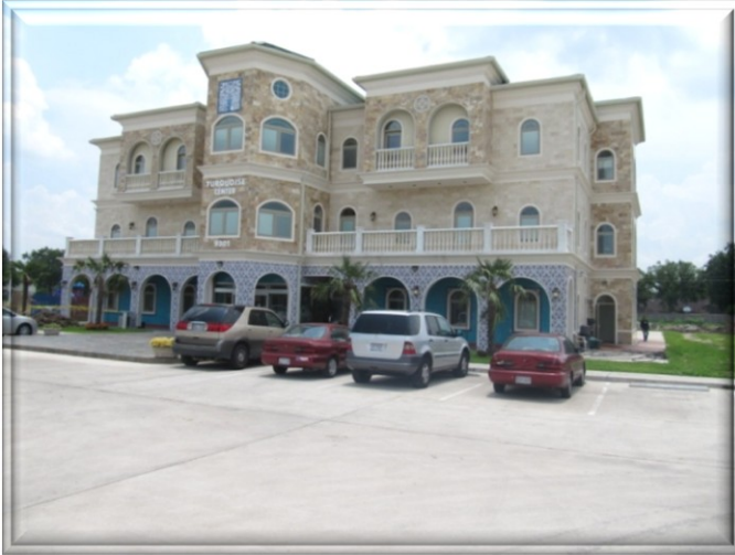
Turkish Center at West Belfort Blvd